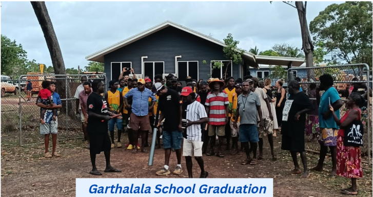
Garthalala School Graduation