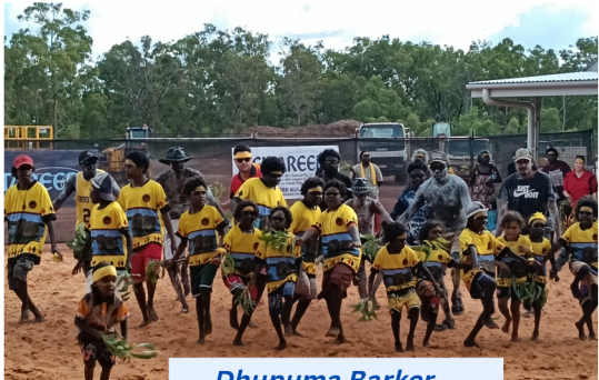
Dhupuma Barker Opening Ceremony

There were over 80 Charles Darwin University graduates, graduating from Cert 1 courses through to Bachelor degrees and Masters Courses - Yolŋu and Balanda - and it was a very proud day for many people and their families and the whole community. Congratulations bukmak!