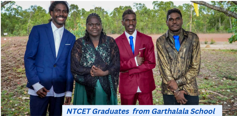
NTCET Graduates from Garthalala School

It is very important to have these ceremonies in our communities that celebrate achievement and learning and I feel very proud to see the young people achieving and growing strong, and we need to continue this work across our communities with our elders and through Yolŋu Rom.