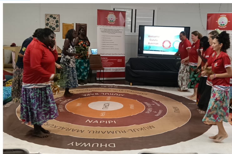
Galiwin'ku Women's Space - Women's Empowerment Forum